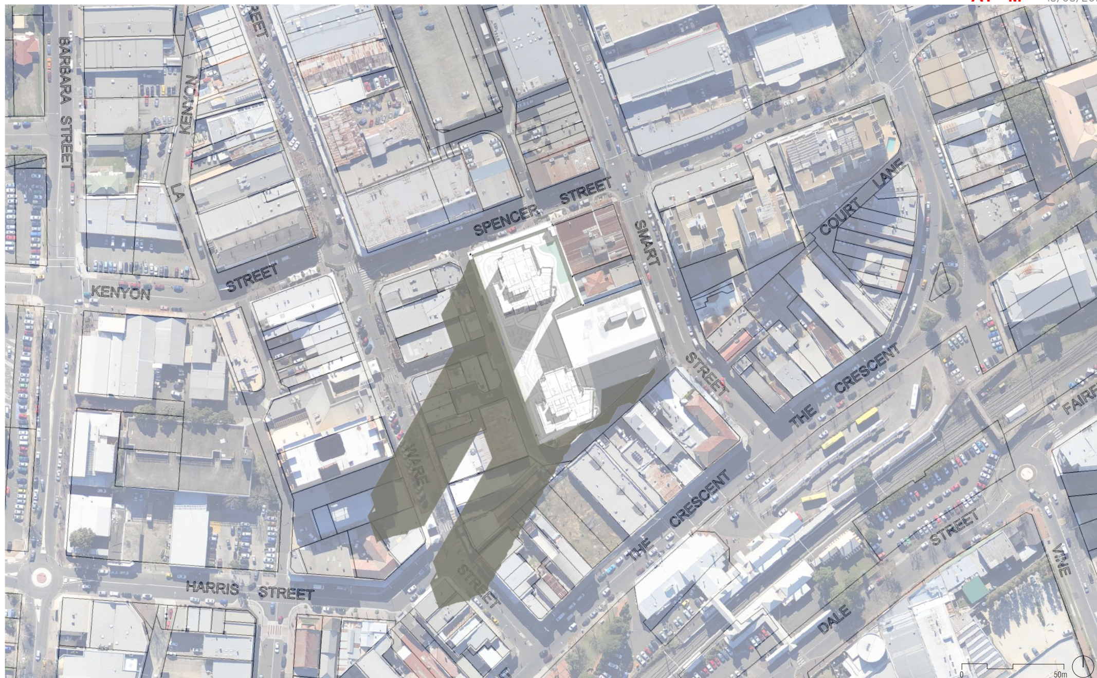
Shadow Analysis June 21, 10am SHADOW ANALYSIS