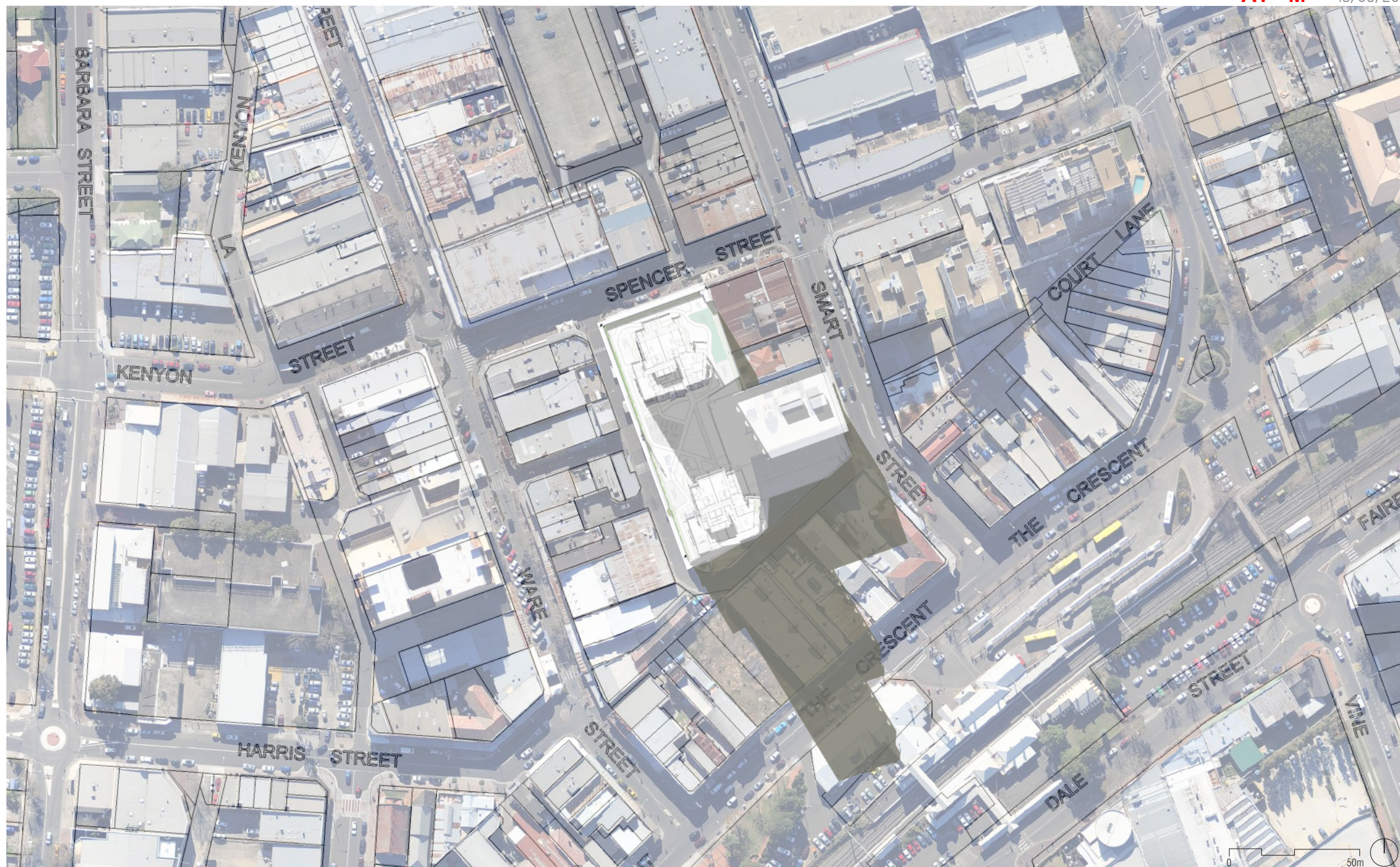
Shadow Analysis June 21, 2pm SHADOW ANALYSIS