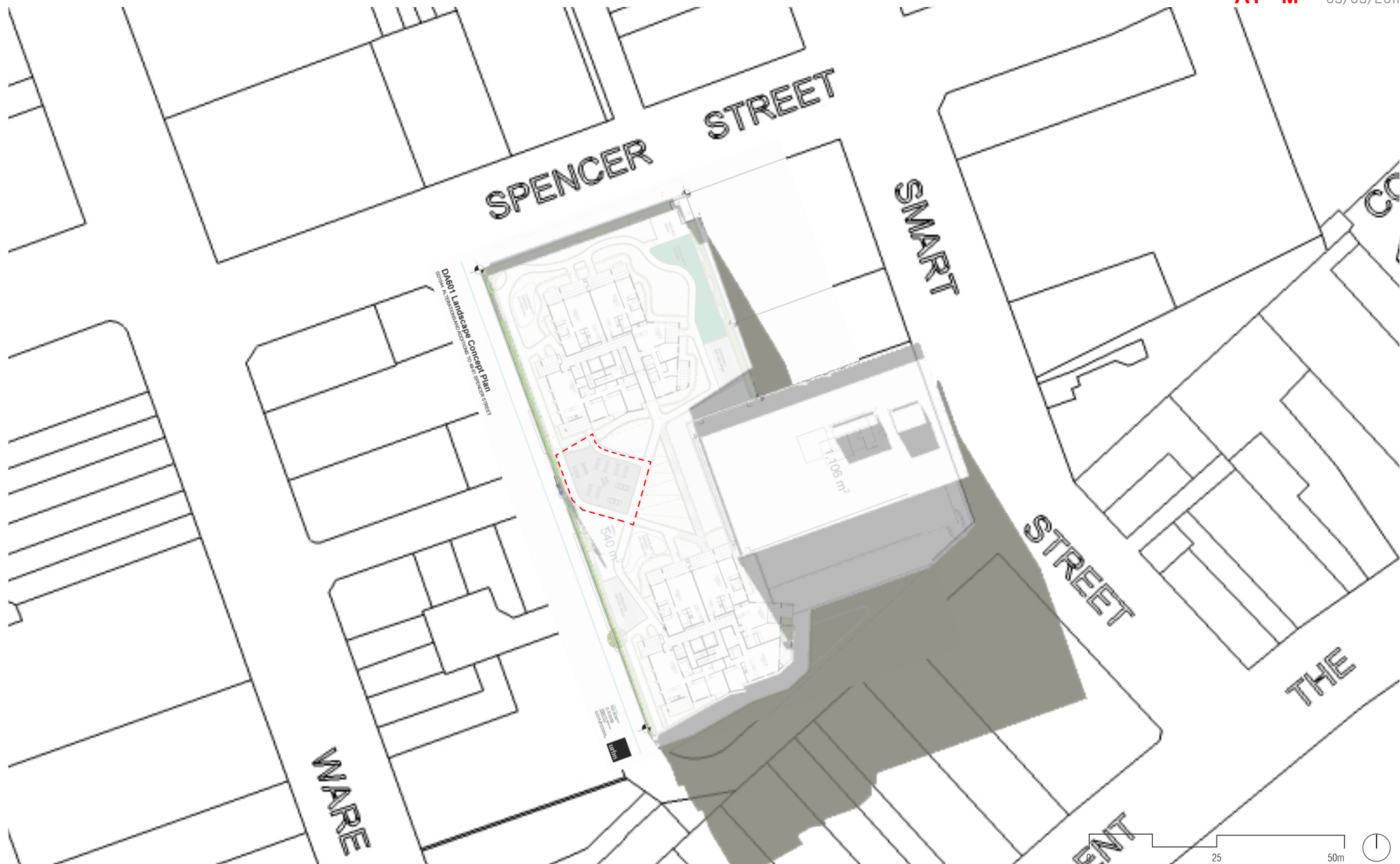
Shadow Analysis June 21, 2pm SHADOW IMPACTS OF EXISTING AFFECTING COMMON OPEN SPACE ON PODIUM