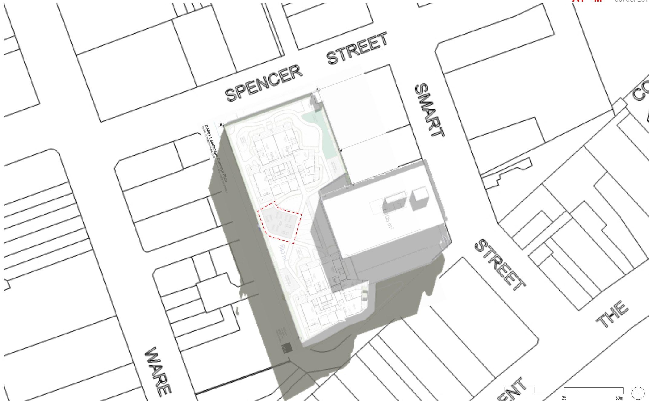
Shadow Analysis June 21, 11am SHADOW IMPACTS OF EXISTING AFFECTING COMMON OPEN SPACE ON PODIUM