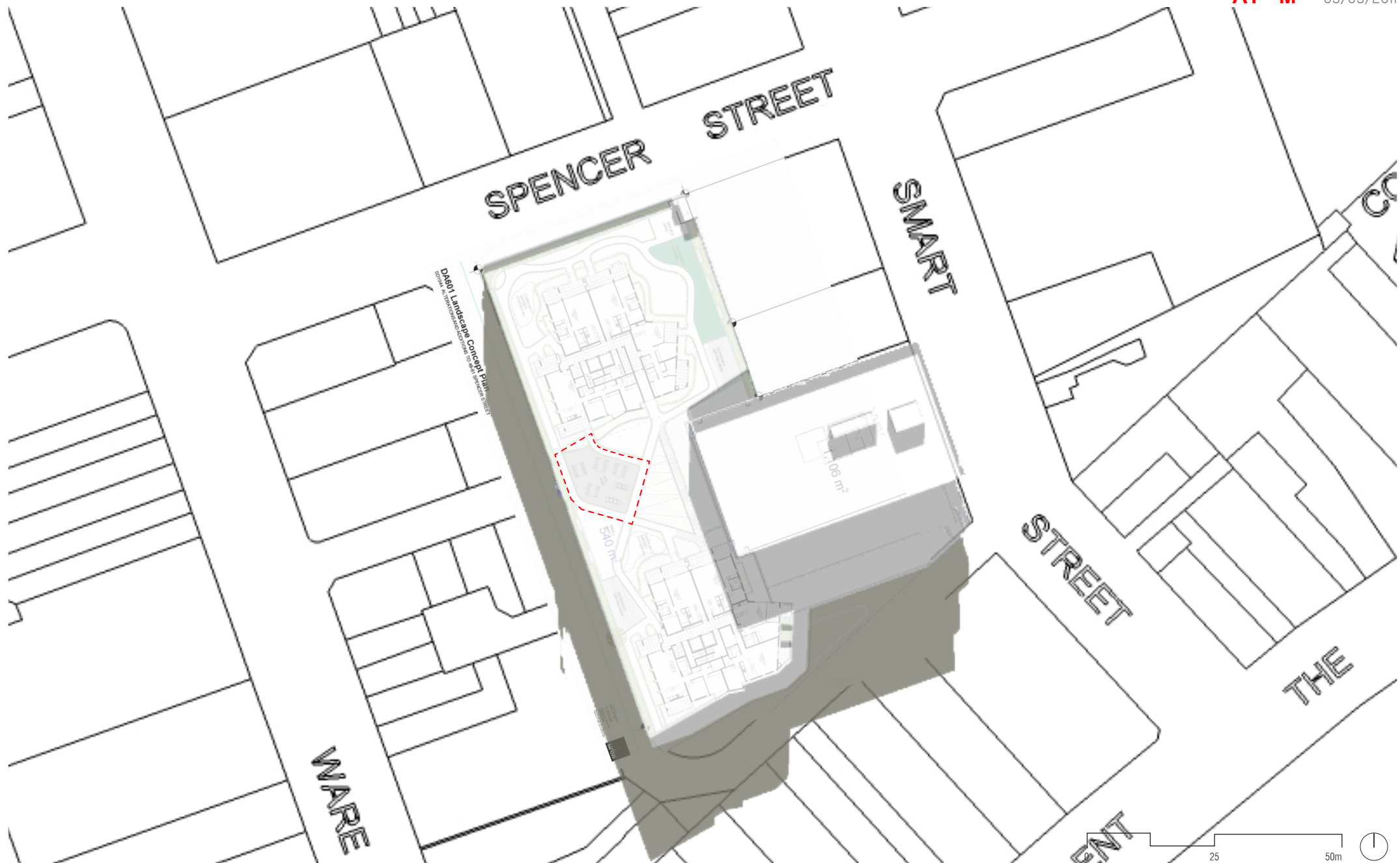
Shadow Analysis June 21, 12pm SHADOW IMPACTS OF EXISTING AFFECTING COMMON OPEN SPACE ON PODIUM