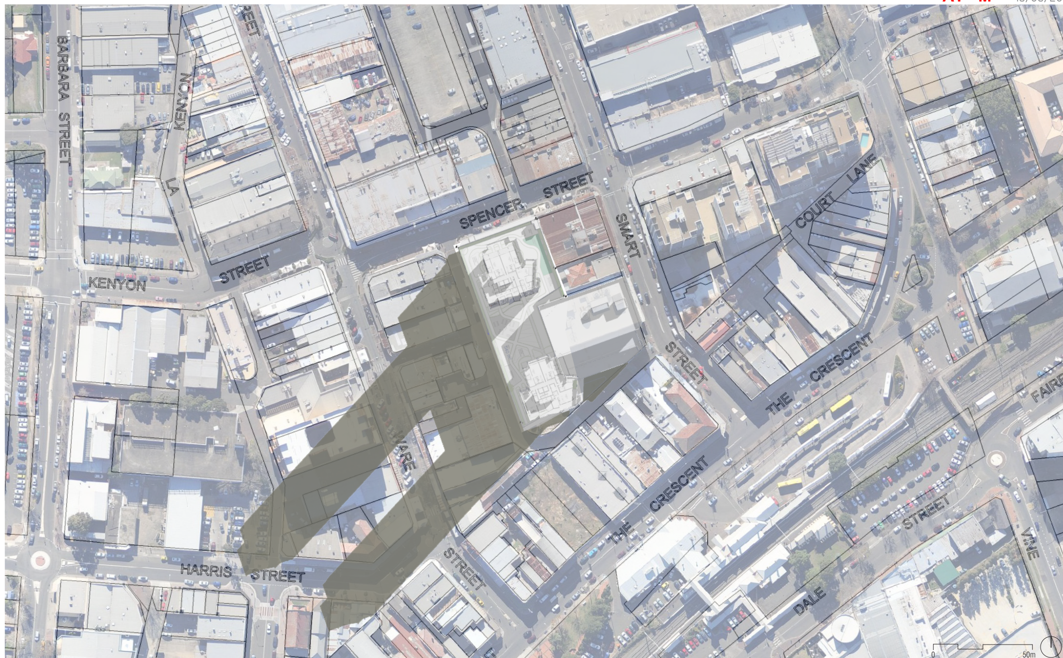
Shadow Analysis June 21, 9am SHADOW ANALYSIS