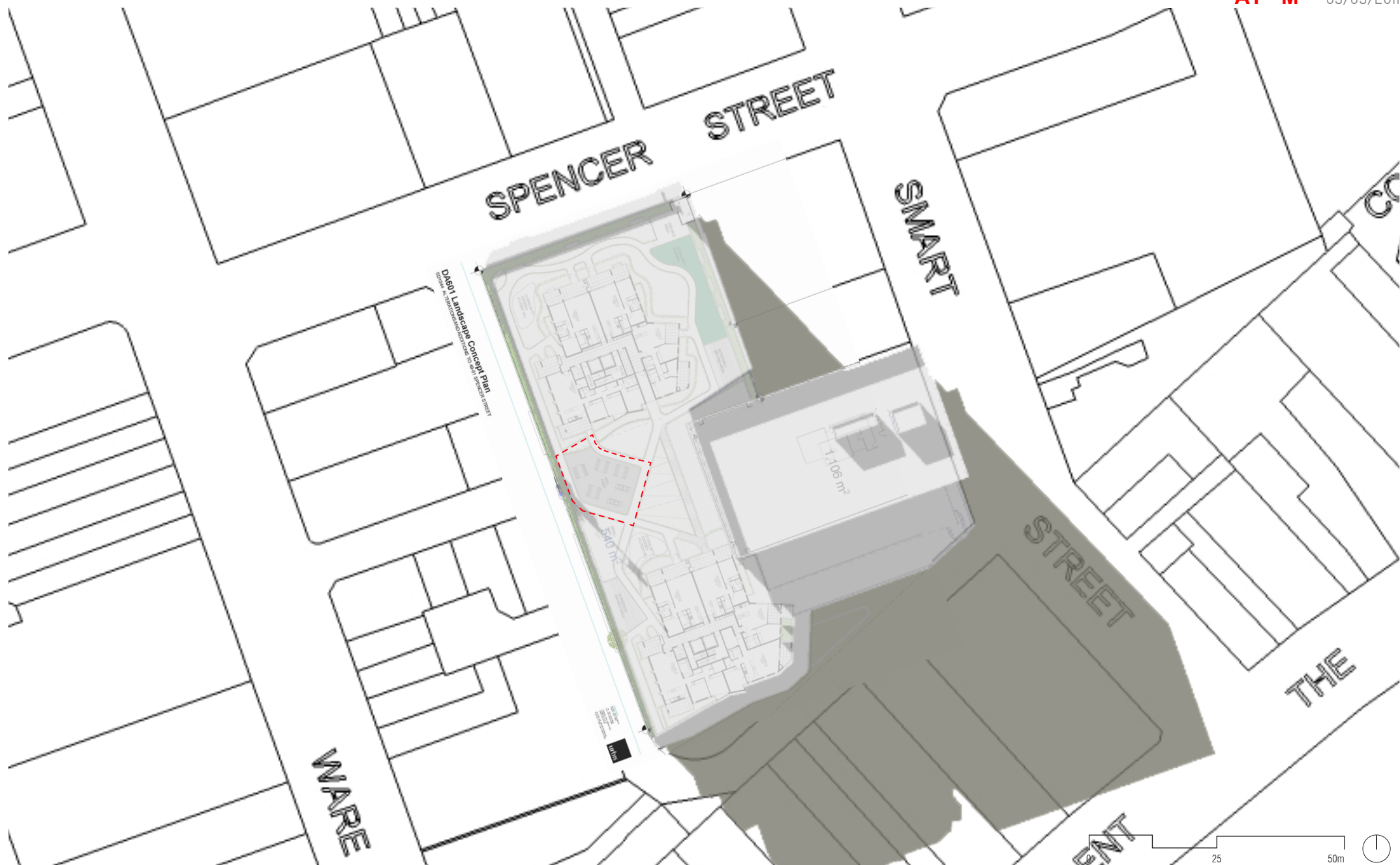
Shadow Analysis June 21, 3pm SHADOW IMPACTS OF EXISTING AFFECTING COMMON OPEN SPACE ON PODIUM