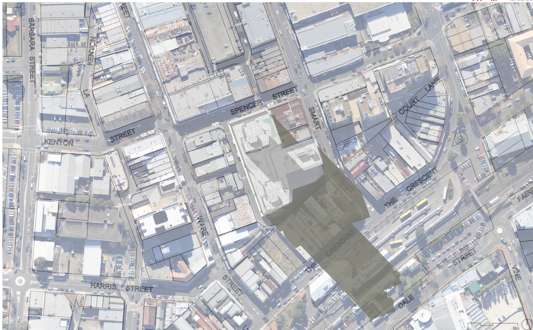
Shadow Analysis June 21, 3pm SHADOW ANALYSIS