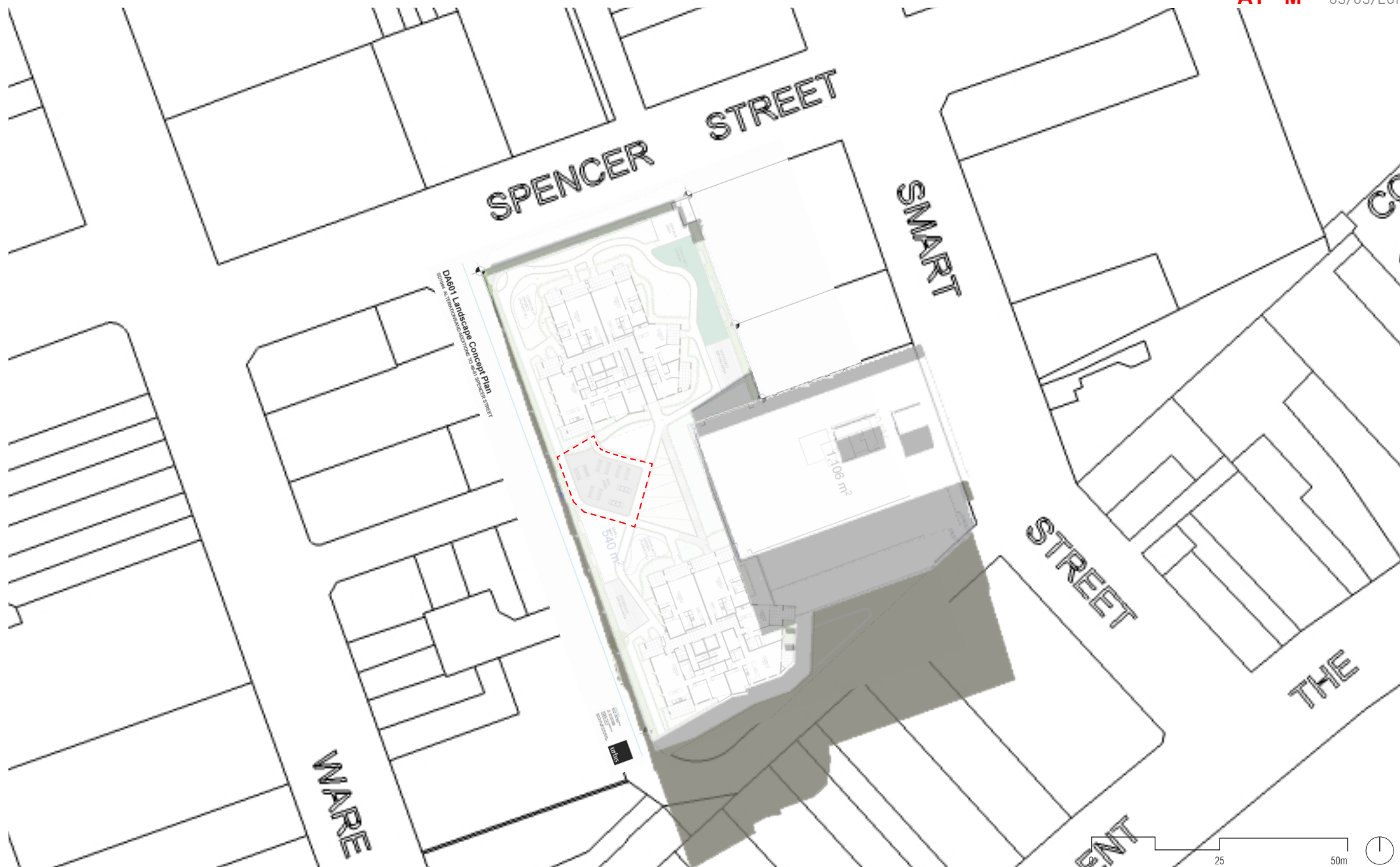
Shadow Analysis June 21, 1pm SHADOW IMPACTS OF EXISTING AFFECTING COMMON OPEN SPACE ON PODIUM