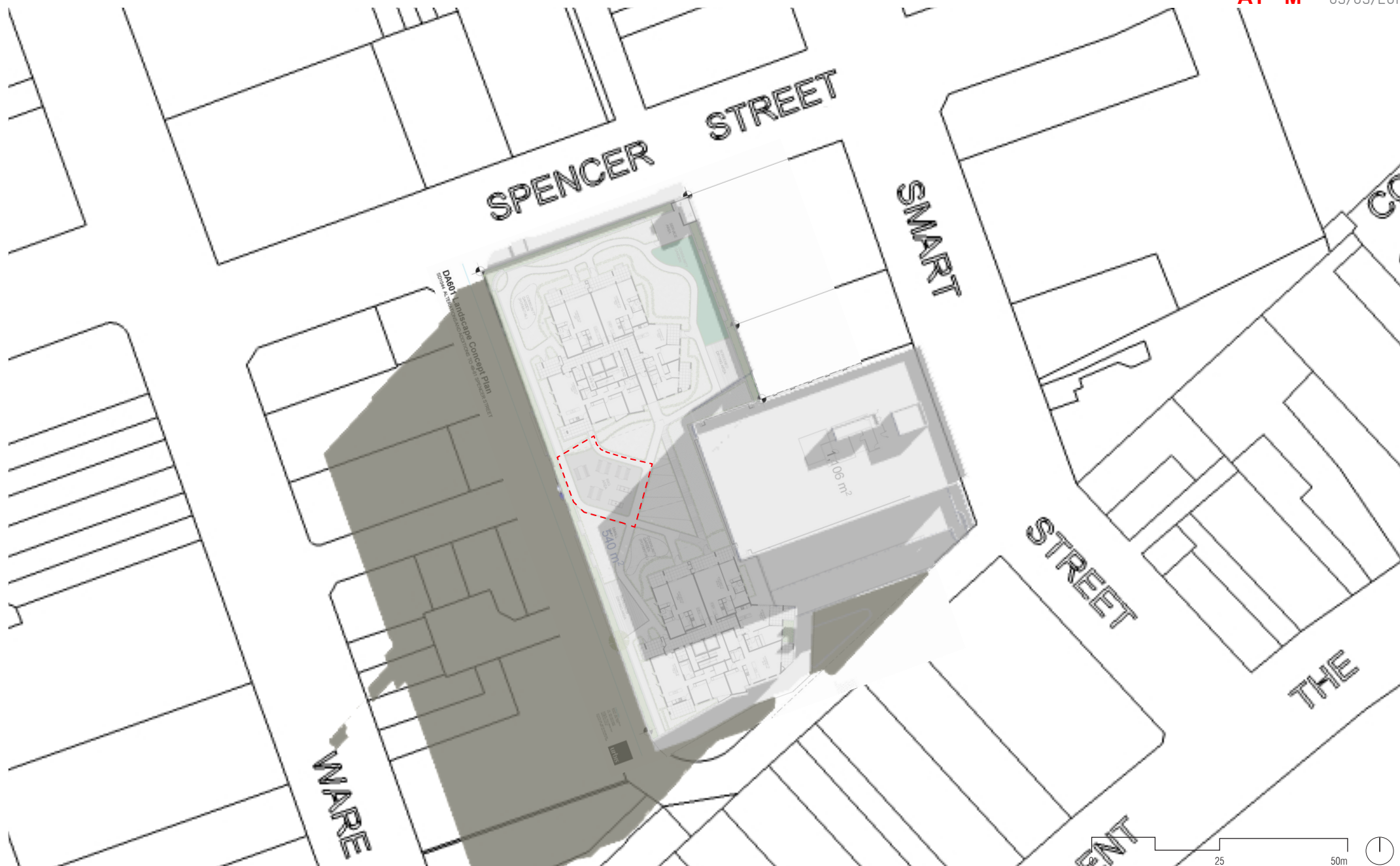
Shadow Analysis June 21, 9am SHADOW IMPACTS OF EXISTING AFFECTING COMMON OPEN SPACE ON PODIUM